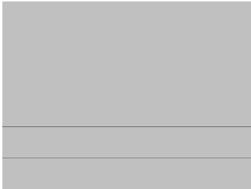
Figure 2: Forecast of %Female Faculty, assuming different proportions of female hiring.

For the sake of a simple model, let us assume that all professors over the age of 65 will retire in the next five years, and all professors between 60 and 65 retire in the subsequent five years, and further, that new hires replace these retirees. Then, as shown in Figure 2, if 20% of the new hires are women (i.e. about the level of the current hiring pool), about 21% of the professors will be women in the year 2015. Even if we replace all of the retiring professors with women, only about 38% of the faculty will be women in 2015. It seems that a reasonable target would be to try and hire between 30% and 40% women, for a target of 23-25% of the faculty being women in 2015. In order to achieve this goal we must continue our proactive search for high-quality women, work on retention of women we have, and further improve on the hiring pool.